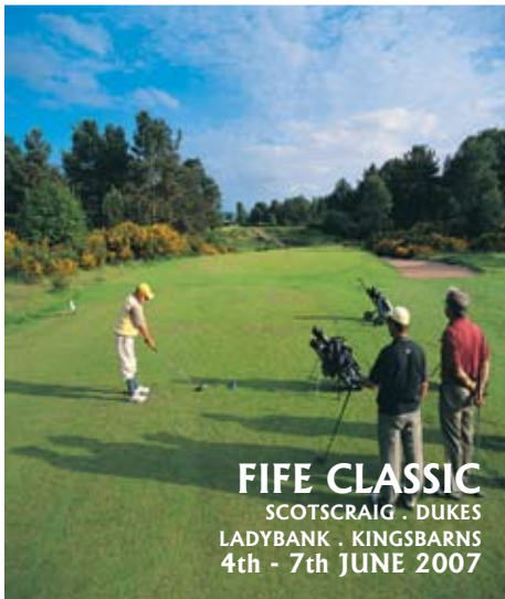
FIFE CLASSIC SCOTSCRAIG . DUKES LADYBANK . KINGSBARNES 4th - 7th JUNE 2007

The Ayrshire Golf Classic is what golf should be about. Fine locations, character hotels, superb golf and great company.